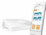
Control via smartphone or by using your voice