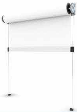
Cable system Open Brackets